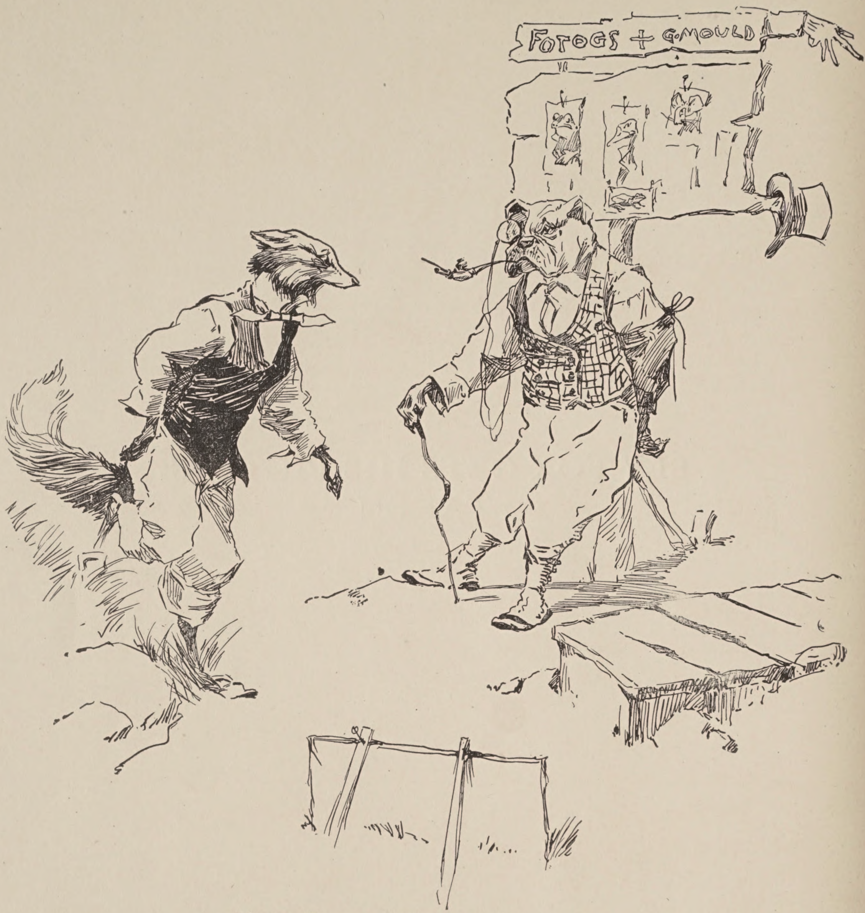
UGLY DOG MEETS SLY FOX AGAIN.